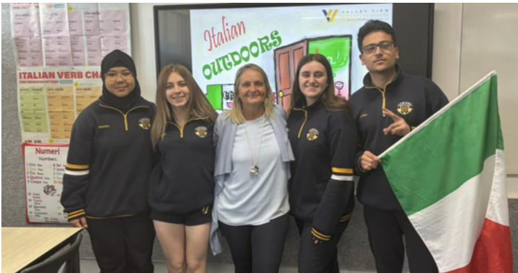
Celebrating Our Year 12 Italian Graduates